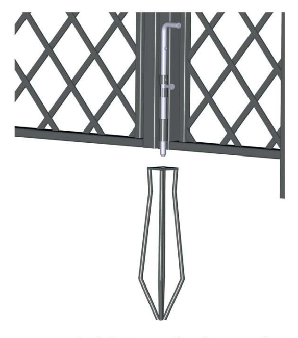
central fixing spike (opened)