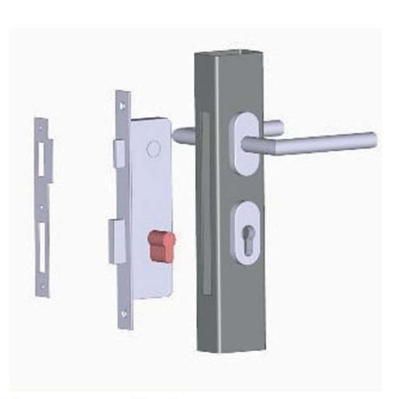
Stainless steel handle - 3 keys supplied