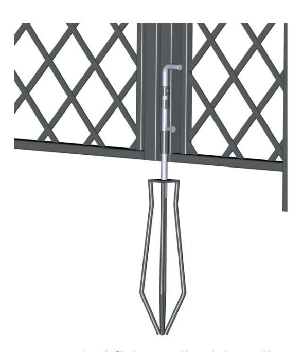
central fixing spike (closed)